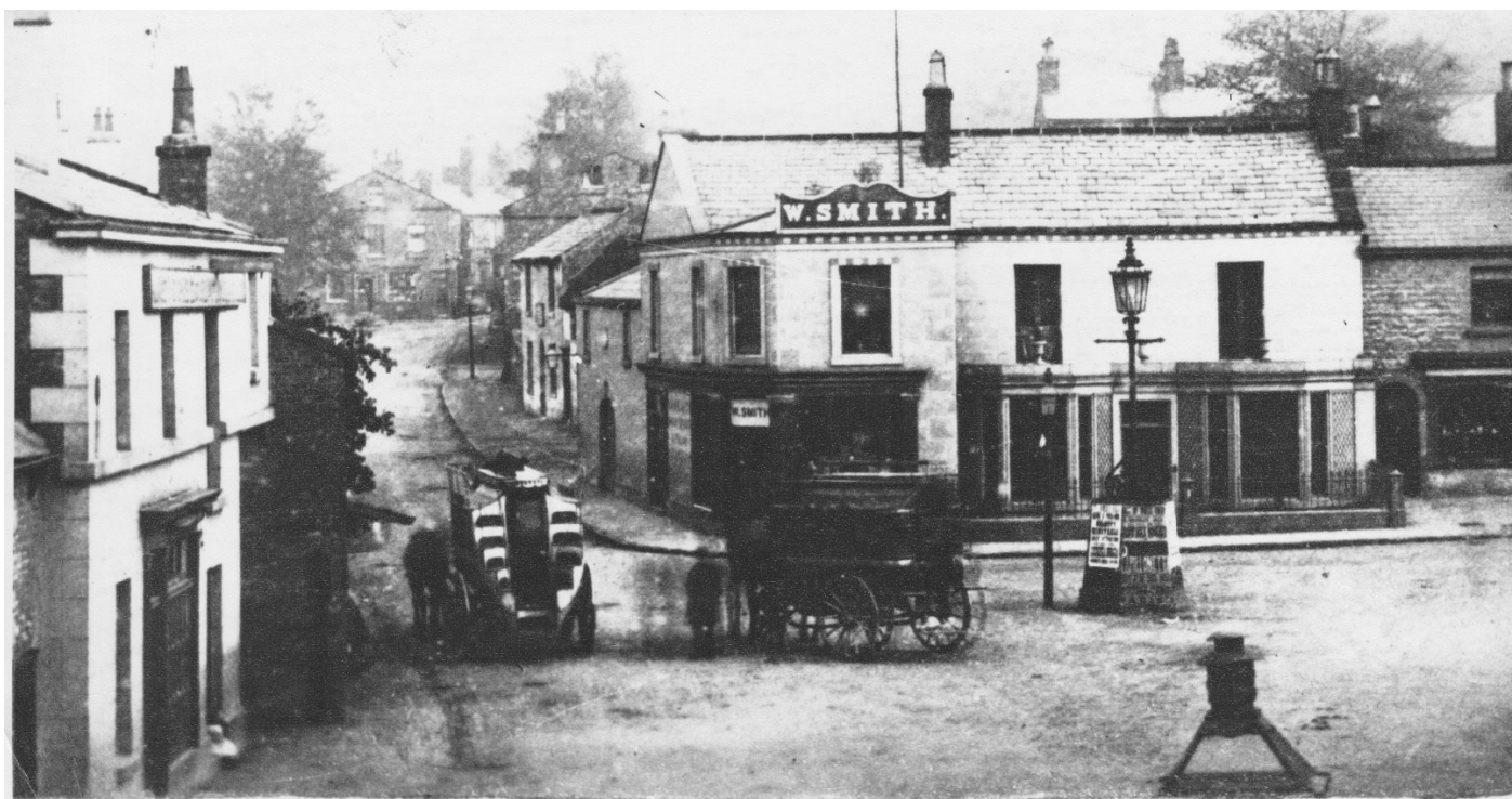
The Village Centre with first lamp standard beside the second lamp standard (with heavy base)