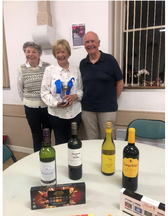
The quiz night winners, The Fantastic Three

The fifth annual quiz night in May saw new champions emerging from the battle of brains. In a very closely run contest over ten rounds, newcomers The Fantastic Three beat reigning champions The Layton Ramblers by just a few points. The winners now have the coveted Quiz Cup until this time next year, when their name will be engraved on the trophy alongside that of previous victors.