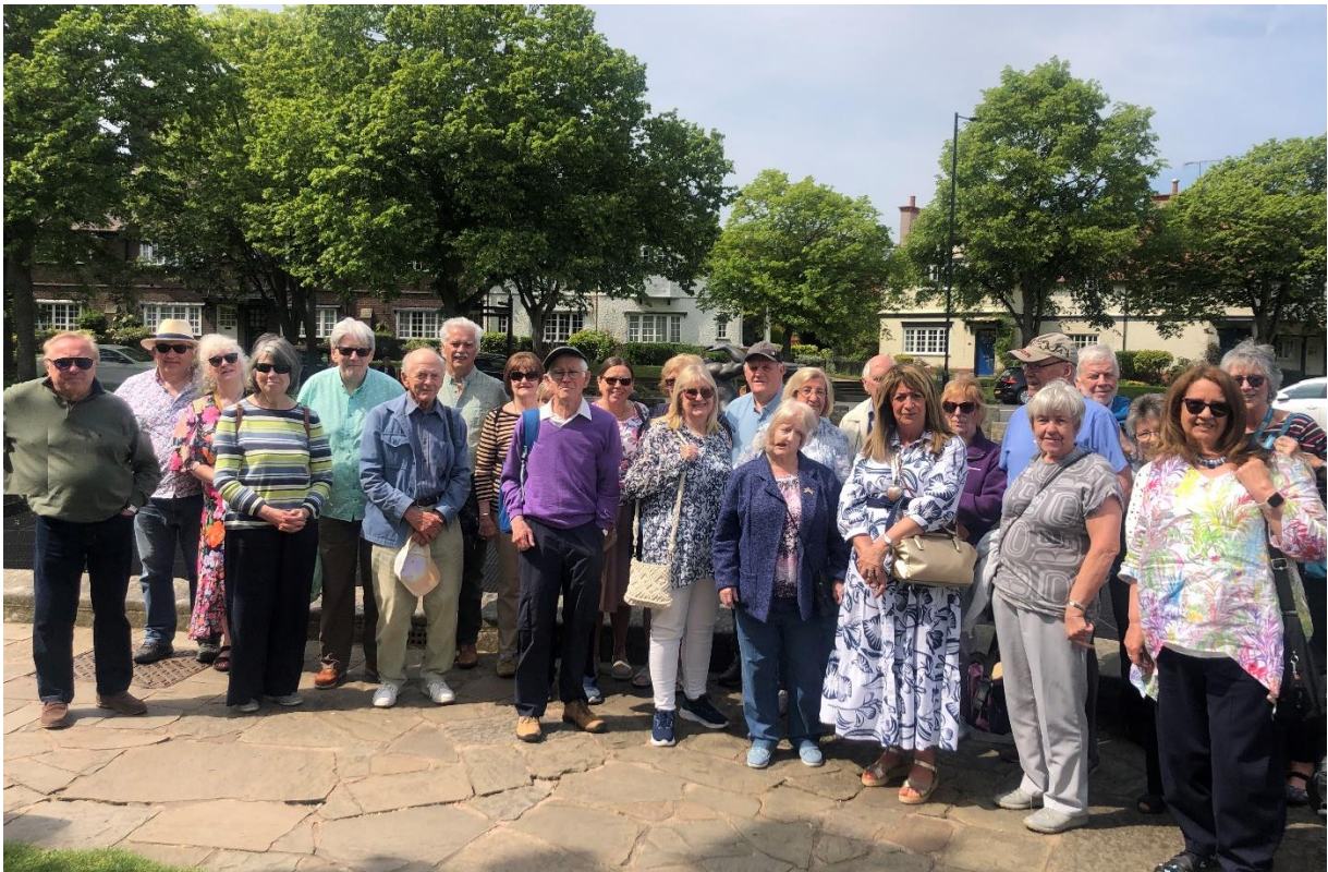
Members outside the Lady Lever gallery