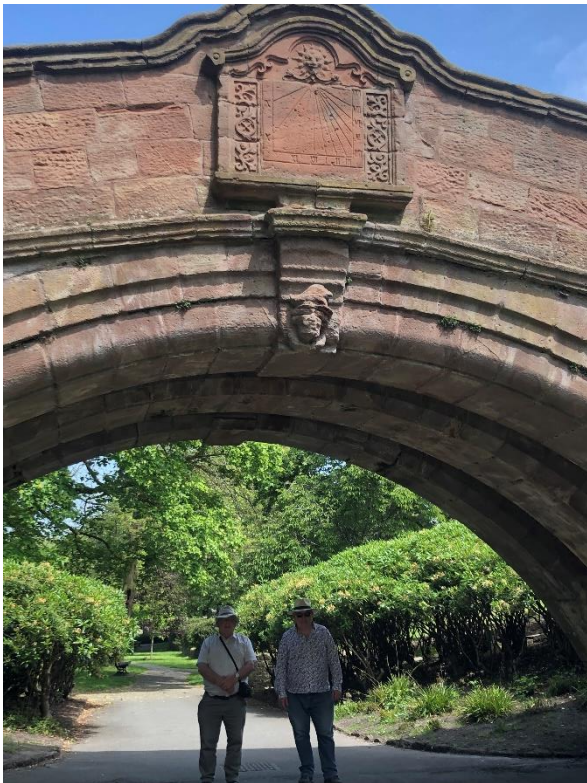
Two members in the Dell Garden