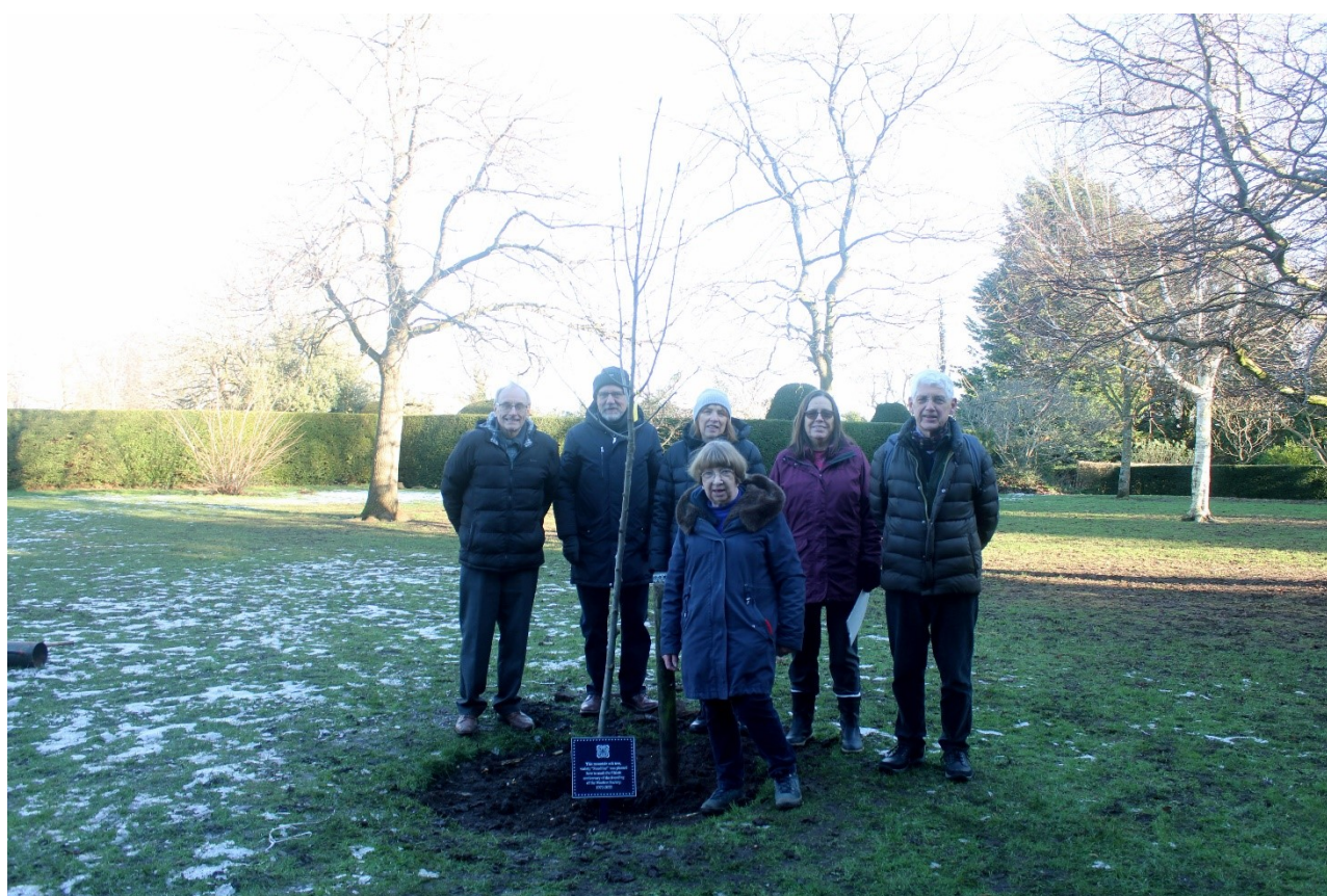
The society's 50 th anniversary tree