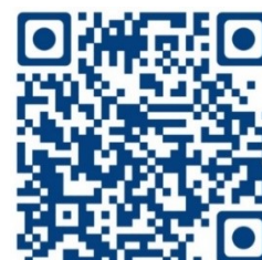
WS QR code