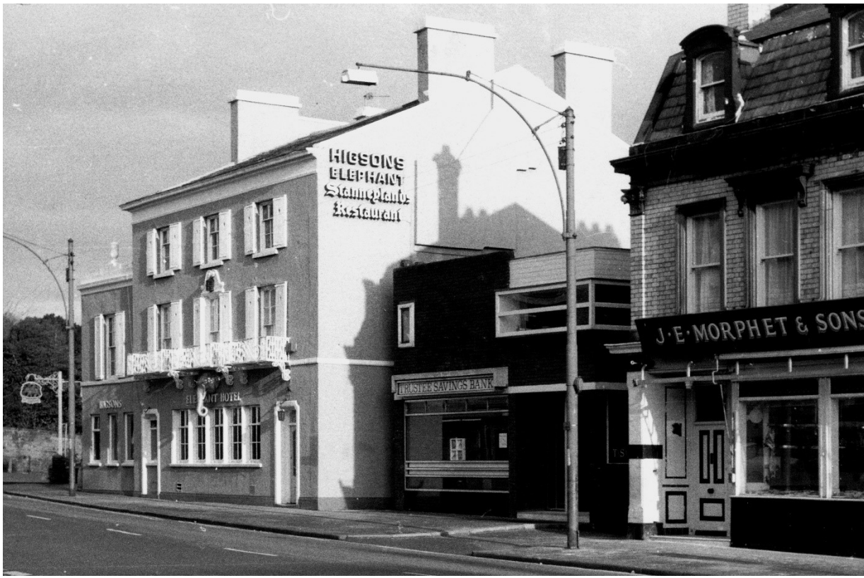
The Elephant pub, Morphets butchers and the Trustee Savings Bank c. 1972