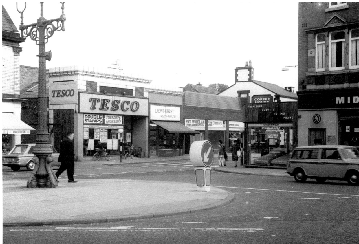
The village centre c. 1972 when the Woolton Society was founded.