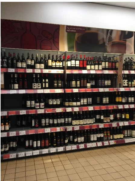
But plenty of wine!