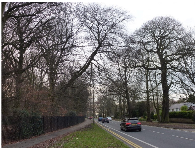
This tree is leaning at an extreme angle and appears to be on the point of collapse on to a busy bus route

Will there have to be another fatality before the council is moved to send tree surgeons around the parks?