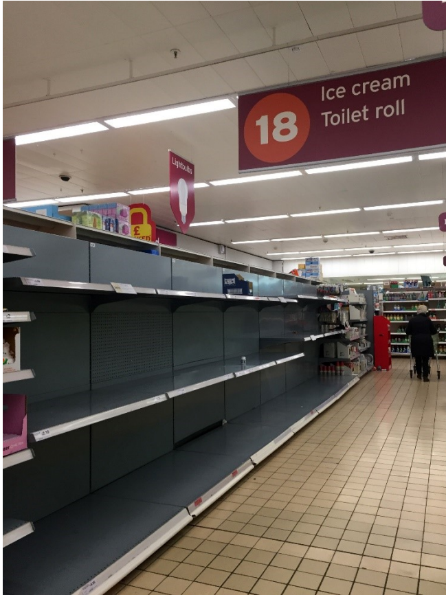
Empty shelves at Sainsbury's.

The main news in this section, unfortunately, is a list of all the events which will no longer take place owing to the coronavirus pandemic.