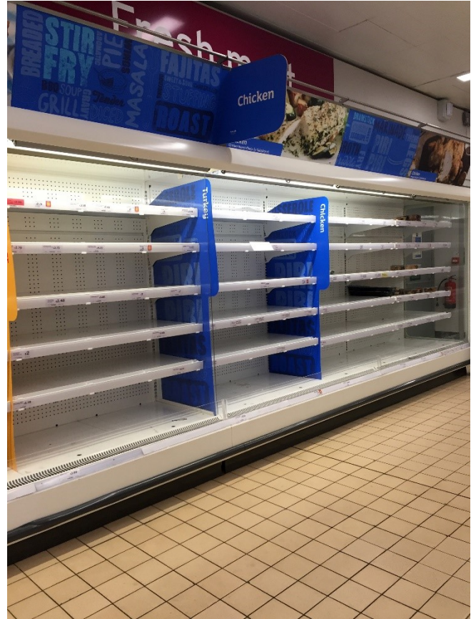
No fresh meat.