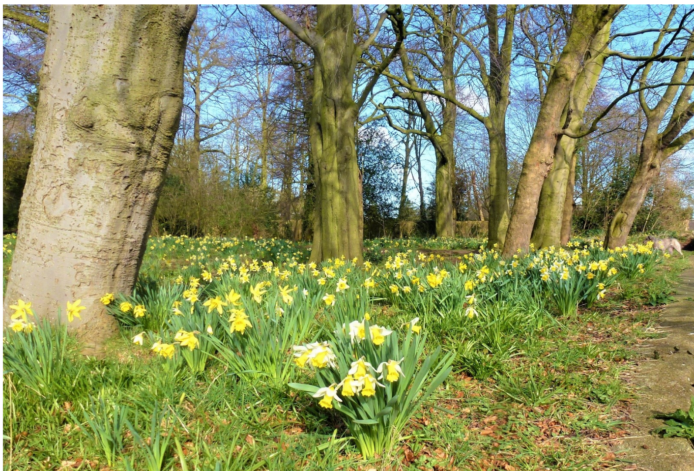
Daffodils in the morning sun in Reynolds Park on first day of Spring