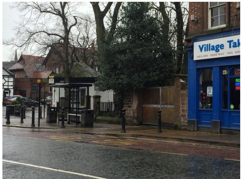
No queues at the bus stop.