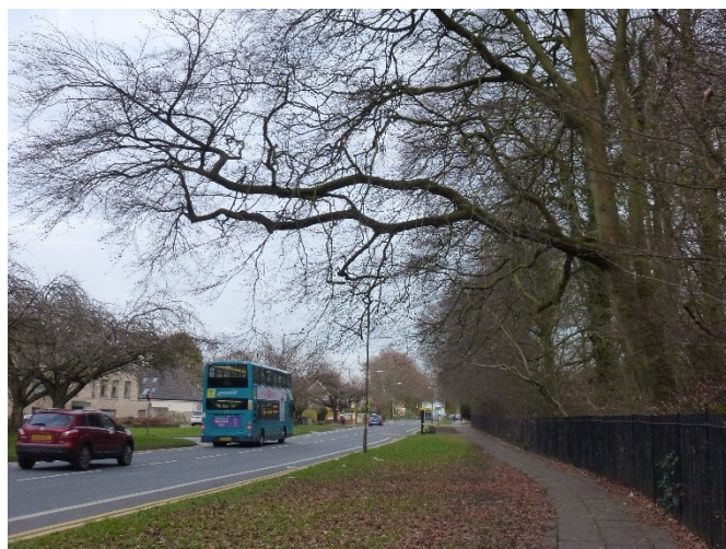
This branch overhangs the carriageway and poses a severe risk to traffic and pedestrians