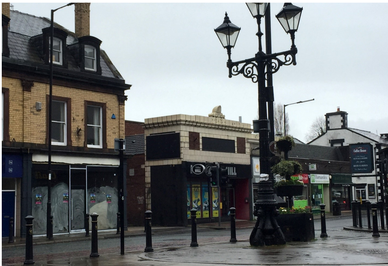
A deserted Woolton Village centre mid-morning on Wednesday 18 March