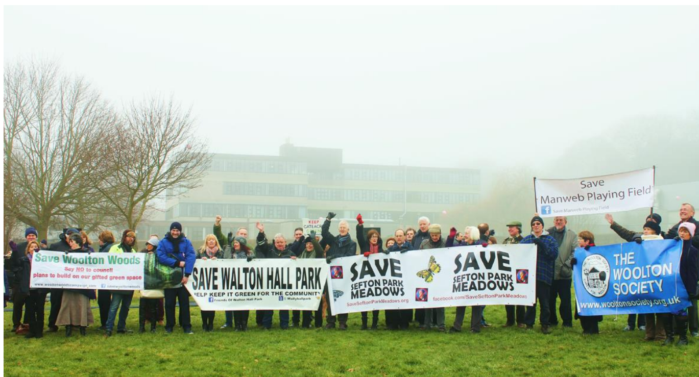
Banners flying on Sunday 8 th February

We wish all new businesses well, & hope that they will prosper, & enhance the village.