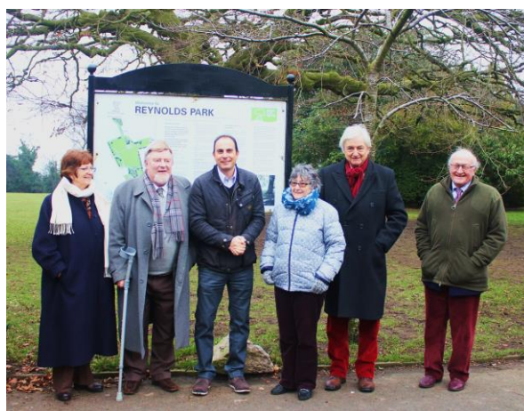
The Reynolds family visiting Reynolds Park